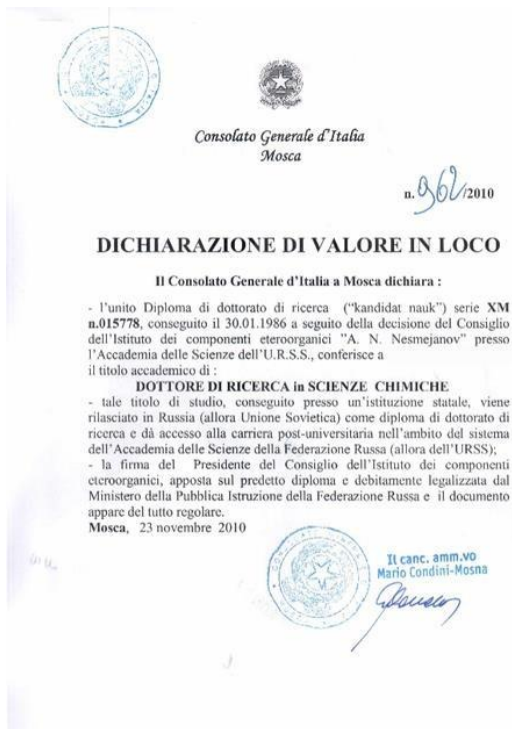
Figura 1 Dichiarazione di Valore

" Dichiarazione di valore " or the Declaration of Value is a document, issued by the competent Italian authority in the country to which the education system of your school refers, which certifies the validity of your Diploma and in particular certifies that you have the right to enter the Italian University. To obtain the Declaration of Value, contact the Italian Consulate in your country.